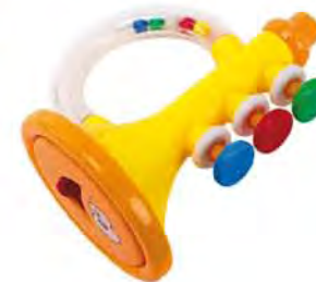
Item No.: G23 Packing : blister card Product size: 10x9cm QTY/CBM: 72pcs/ 0.076