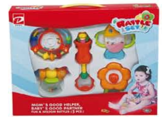
Item No.: 6405 Packing : window box Packing size: 40.5x33.4x5.4cm QTY/CBM: 24pcs/ 0.229 G./N.W: 18/ 13.5kgs