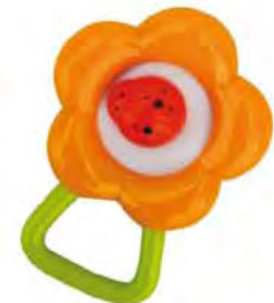
Item No.: G21 Packing : blister card Product size: 13x9.5cm QTY/CBM: 72pcs/ 0.067