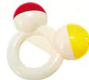
Item No.: G24 Packing : blister card Product size: 9.5x10.5cm QTY/CBM: 72pcs/ 0.067