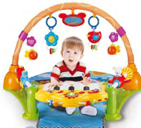
B SIT & PLAY 6M+

Item No.: 8868 Packing : color box Packing size: 66x44.2x11.5cm QTY/CBM: 4pcs/ 0.17 G./N.W: 15/ 12.2kgs