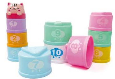
Item No.: G109 Packing : slide card Packing size: 14x10x24cm QTY/CBM: 48pcs/ 0.165 G./N.W: 15/ 12.5kgs