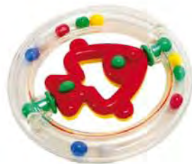
Item No.: G14 Packing : blister card Product size: 10x10cm QTY/CBM: 72pcs/ 0.028