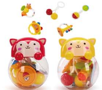
Item No.: 6505 Packing : plastic can Packing size: 14x14x18cm QTY/CBM: 48pcs/ 0.187 G./N.W: 20/ 16kgs