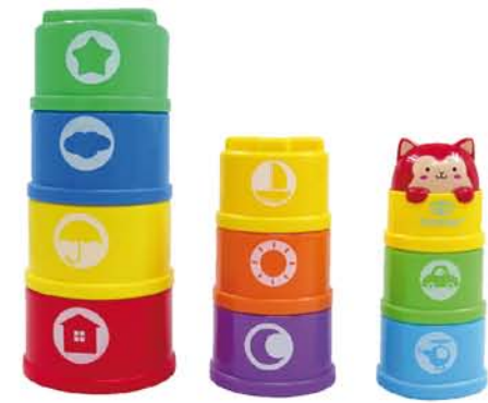
Item No.: G108 Packing : display box Packing size: 14x10x24cm QTY/CBM: 48pcs/ 0.165 G./N.W: 17.2/ 15kgs