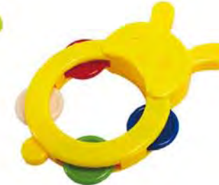
Item No.: G20 Packing : blister card Product size: 9x12.7cm QTY/CBM: 72pcs/ 0.049