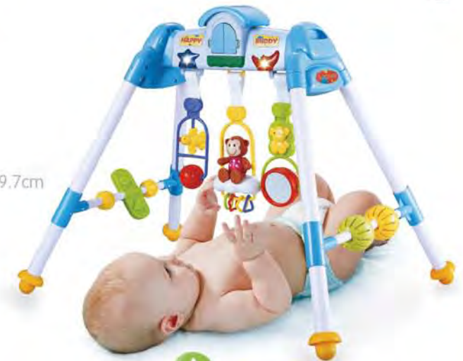
A LAY & PLAY 3M+

Item NO.: 6922B Packing : color box Packing size: 53.5x32.6x9.7cm QTY/CBM: 6pcs / 0.137 G./N.W.: 16 / 13kgs