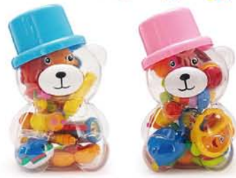
Item No.: 6510 Packing : plastic can Packing size: 16.5x15.5x27cm QTY/CBM: 24pcs/ 0.177 G./N.W: 20/ 15.5kgs