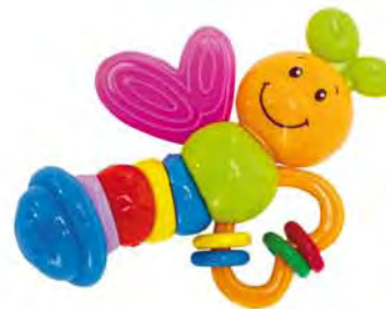
Item No.: G19 Packing : blister card Product size: 14.5x11cm QTY/CBM: 72pcs/ 0.089