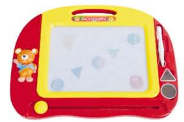
Item No.: 8631A Packing : color box Packing size: 39x5x29.5cm QTY/CBM: 24pcs/ 0.17 G./N.W: 22/ 19.7kgs