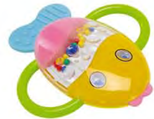
Item No.: G18 Packing : blister card Product size: 12.5x11.3cm QTY/CBM: 72pcs/ 0.048