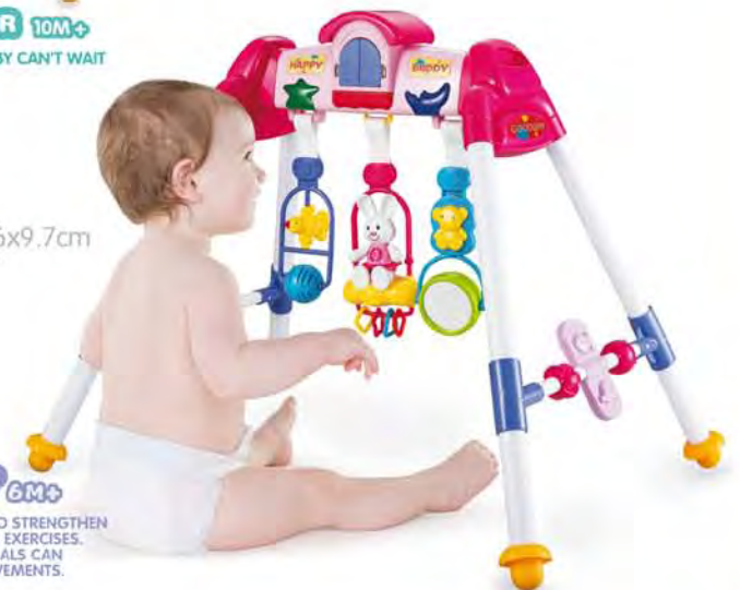
B SIT & PLAY 6M+

Item NO.: 6922C Packing : color box Packing size: 53.5x32.6x9.7cm QTY/CBM: 6pcs / 0.137 G./N.W.: 16 / 13kgs