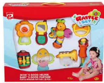
Item No.: 6408 Packing : window box Packing size: 48x37.8x8.9cm QTY/CBM: 10pcs/ 0.176 G./N.W: 12/ 8.6kgs