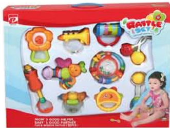
Item No.: 6410 Packing : window box Packing size: 54x41x8.5cm QTY/CBM: 10pcs/ 0.211 G./N.W: 13/ 10kgs