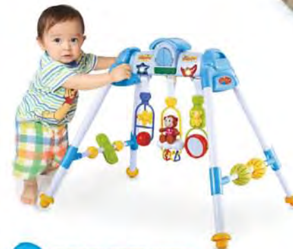
C BABY WALKER 10M+

BABIES OVER 3 MONTHS START TO HAVE RICH COLOR PERCEPTION. THE LOVELY AND COLORED SUSPENDED TOYS CAN ATTRACT THEIR ATTENTION. WITH DYNAMIC PEDAL KEYS, BABIES CAN CONDUCT ALL-AROUND EXERCISES