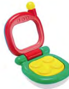
Item No.: G16 Packing : blister card Product size: 13x6cm QTY/CBM: 72pcs/ 0.045