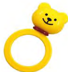
Item No.: G15 Packing : blister card Product size: 7.5x12cm QTY/CBM: 72pcs/ 0.056