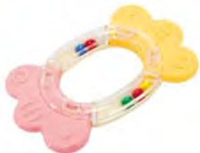
Item No.: G13 Packing : blister card Product size: 10.7x6.5cm QTY/CBM: 72pcs/ 0.024