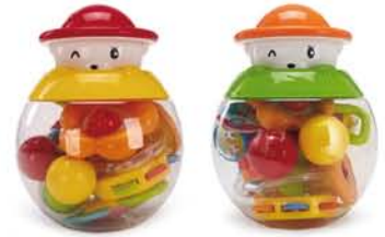
Item No.: 6508 Packing : plastic can Packing size: 16.2x16.2x21.5cm QTY/CBM: 36pcs/ 0.236 G./N.W: 25/ 19kgs