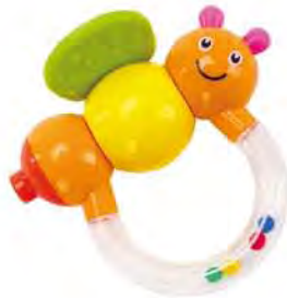
Item No.: G11 Packing : blister card Product size: 9.5x10cm QTY/CBM: 72pcs/ 0.054