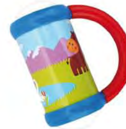
Item No.: G17 Packing : blister card Product size: 10x8.2cm QTY/CBM: 72pcs/ 0.062