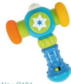
Item No.: G104 Packing : window box Packing size: 16.5x6.5x19cm QTY/CBM: 72pcs/ 0.178 G./N.W: 16.7/ 13.7kgs