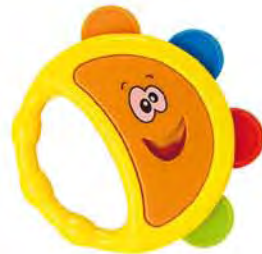
Item No.: G12 Packing : blister card Product size: 9.5x9cm QTY/CBM: 72pcs/ 0.029