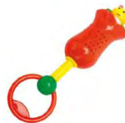
Item No.: G22 Packing : blister card Product size: 19x6cm QTY/CBM: 72pcs/ 0.064