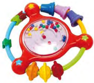
Item No.: G10 Packing : blister card Product size: 12x12cm QTY/CBM: 72pcs/ 0.054