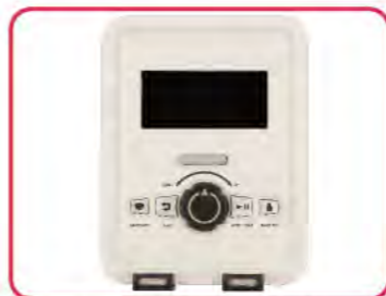
LCD Size:131X67MM Console Size:270X205X70MM