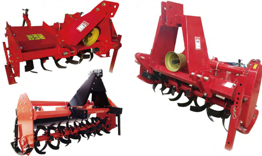
side transmission series rotary tiller

1GLN series rotary tiller is used in side gear transmission structure, It can be matched with 12-120 horsepower tractor. The machine adopts wide range of symmetrical suspension to cover the wheel track. The machine is reliable in quality and good in performance, and can be suitable for dry land and paddy land . It can save time, labor and lower cost.