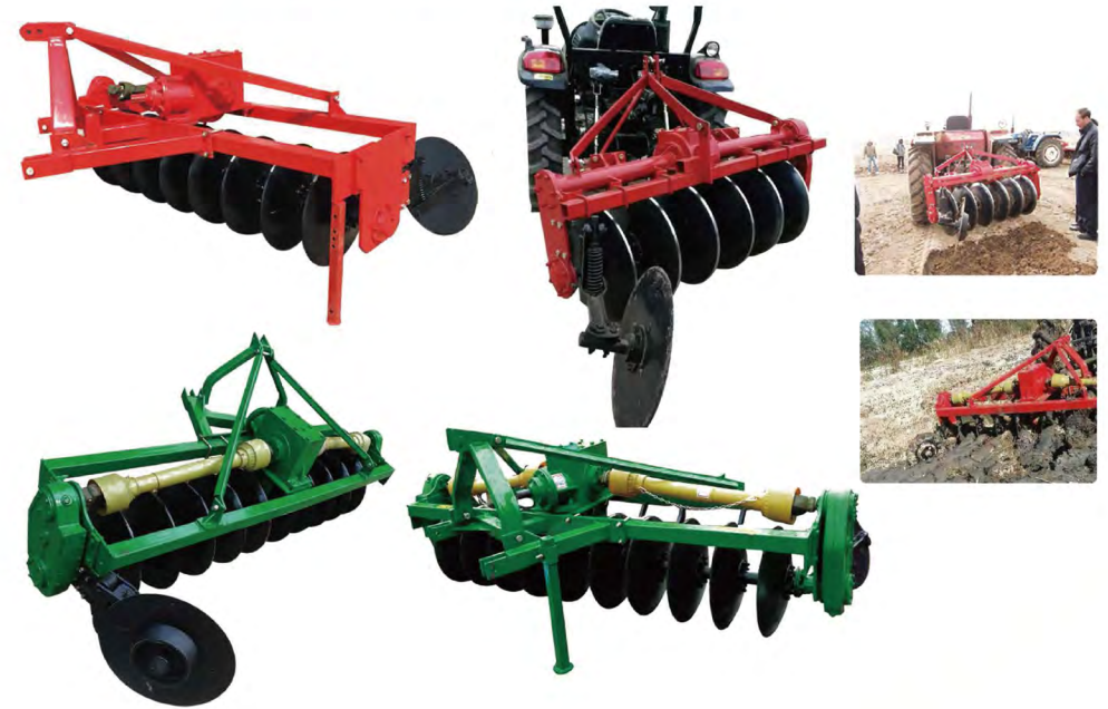
1LYQ series driven disc plough

1LYQ series driven disc plough is mounted with tractor by the rear 3-point suspension device and drives the plough discs to rotate in the way of delivering power by tractor's rear PTO to the disc plough's gearbox. This machine is mainly used for cultivating on paddy field with the advantages of non-tangling weeds, high quality and efficiency.