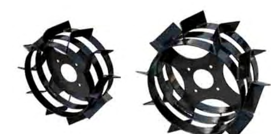
3.50-6 Iron Wheel