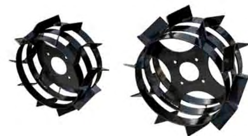
3.50-6 Iron Wheel