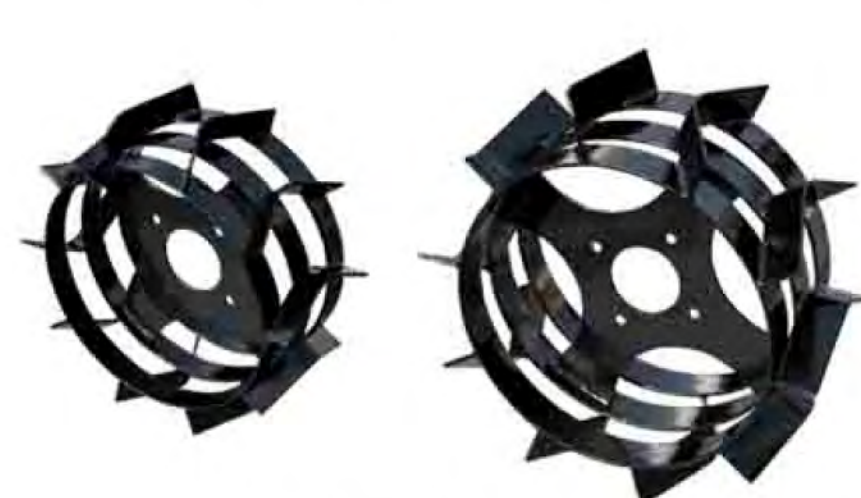
4.00-8 Iron Wheel