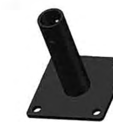
3.5-6/4.0-8 Wheel Axle (Circular Tube)