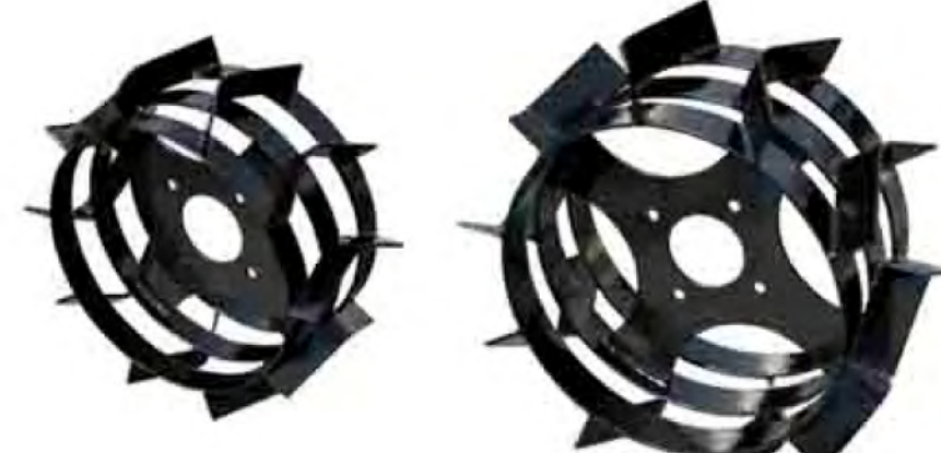
3.50-6 Iron Wheel