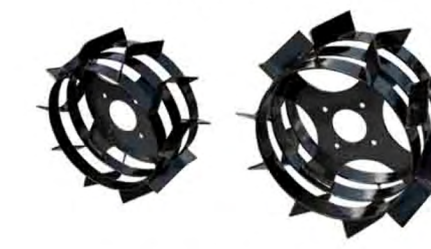
3.50-6 Iron Wheel