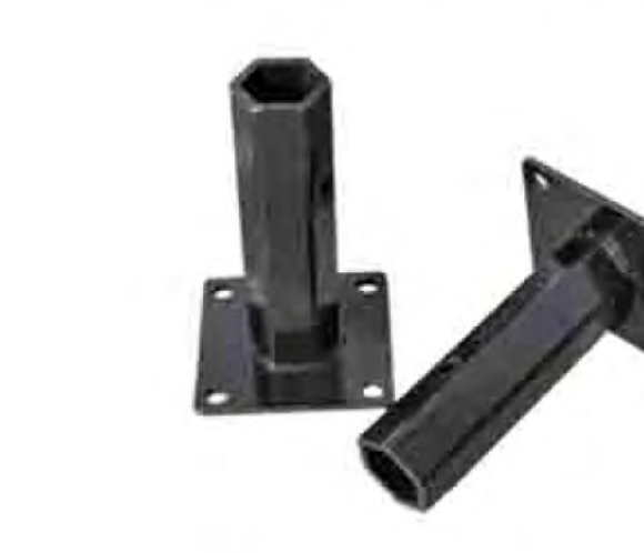
3.5-6/4.0-8 Wheel Axle (Hexagonal Tube)