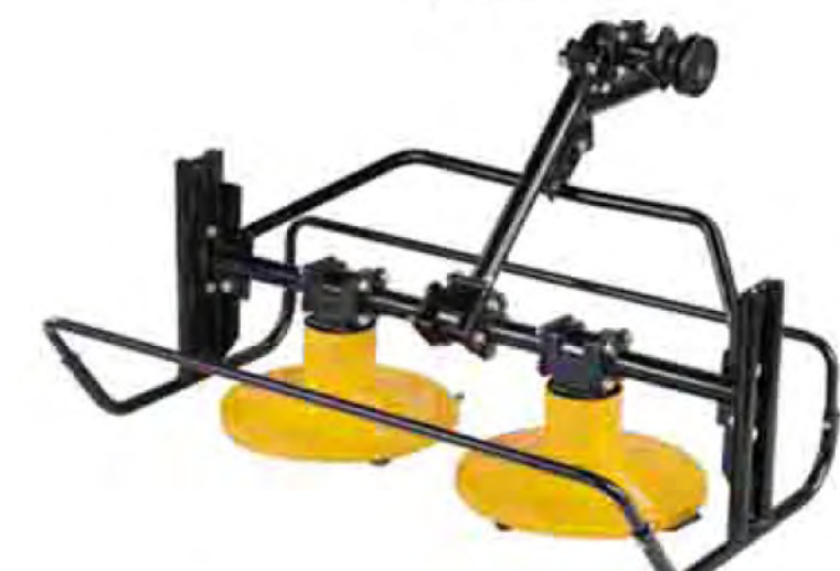
Grass Cutting Wheel