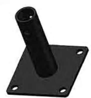
3.5-6/4.0-8 Wheel Axle (Circular Tube)