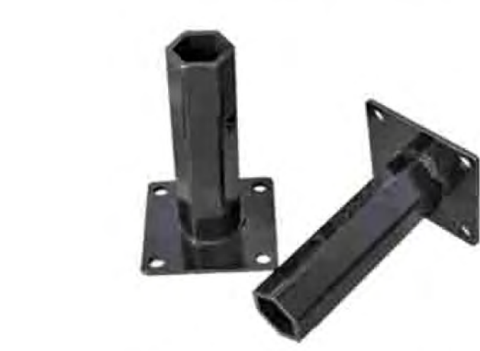
3.5-6/4.0-8 Wheel Axle (Hexagonal Tube)