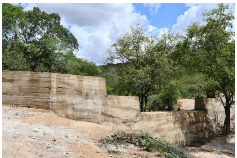
Figure 1 The dam ready for action