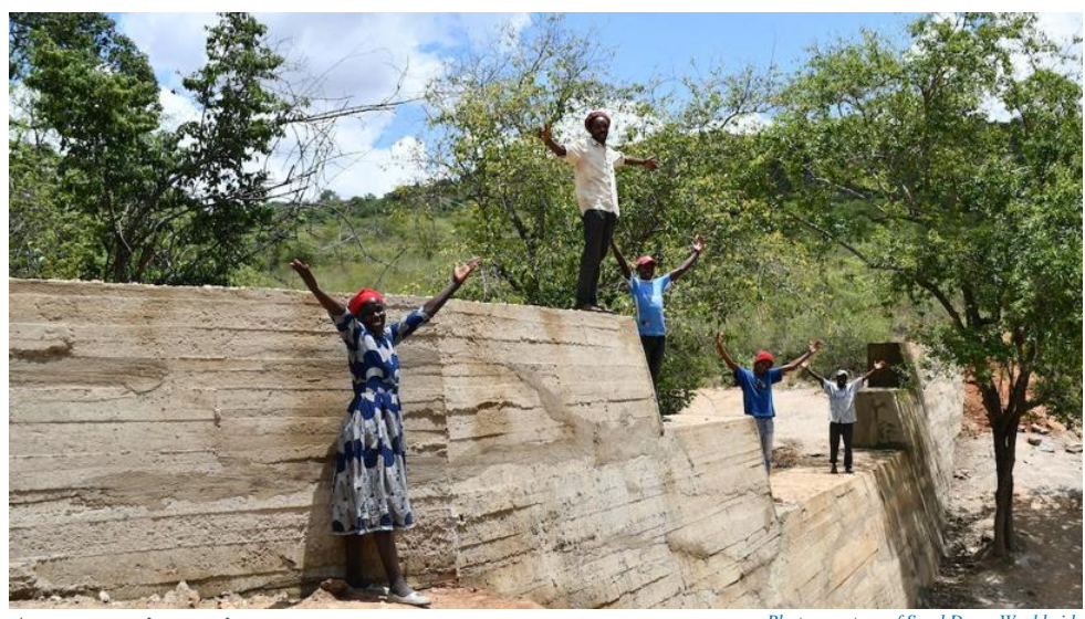
A community project

Over 1500 people in the immediate area will benefit and eventually, when the water table becomes higher, other local communities may also benefit.