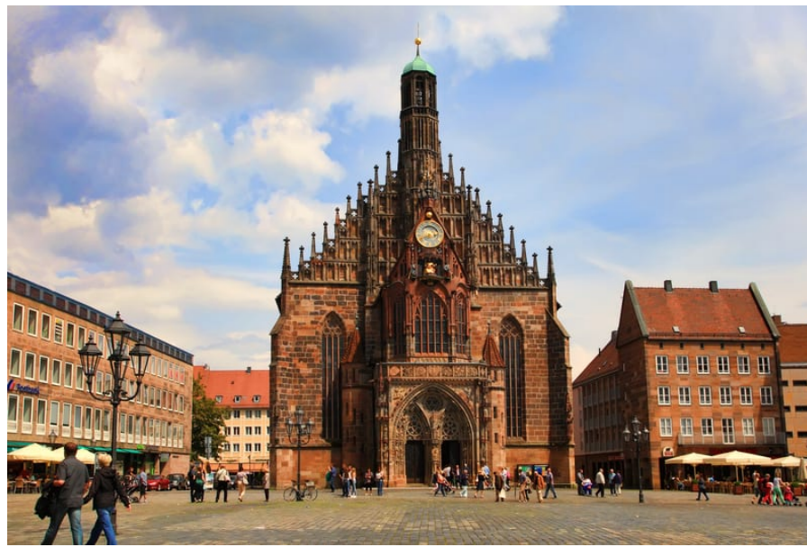
The Nuremburg Code was created as an ethical benchmark to protect against medical experimentation. Do mandatory masks and vaccines break it?

important set of principles decided upon in 1947. I refer to the Nuremburg Code , the set of 10 points that arose from the infamous Nuremburg Trials conducted in the aftermath of World War II. I am not passing judgement on how impartial those trials were, because I know they were mainly run by the US and the Allies (as the victors), who for obvious reasons did not press charges against American