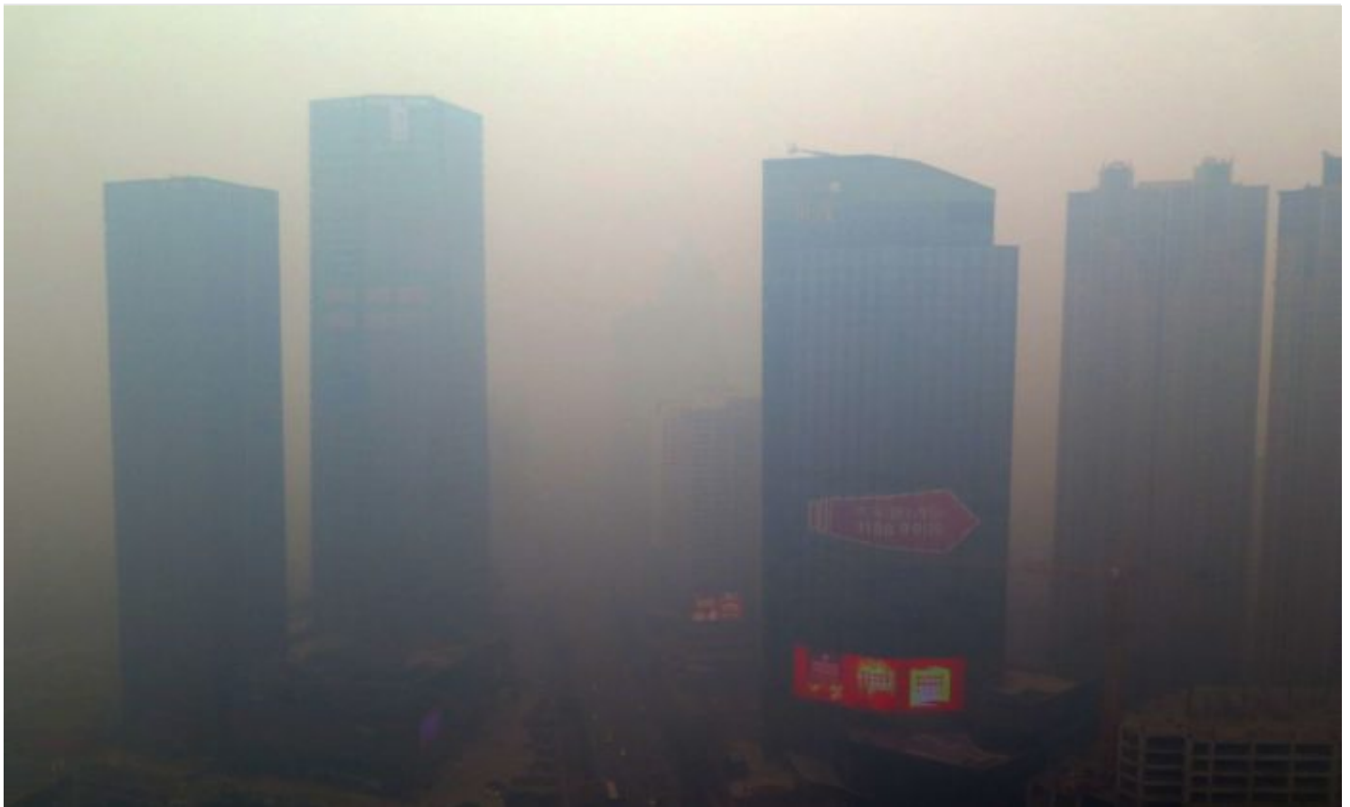
A residential block covered in smog in Shenyang, China's Liaoning Province on Nov. 8, 2015.