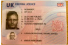
Driving Licence (1).jpg 63K

Email: info@spellingschool.com T: 0044 (0)1865 517 089