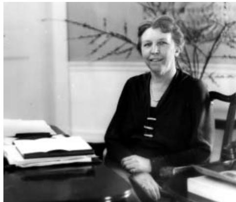
Ada Louise Comstock, President of Radcliffe College from 1923-1943. Schlesinger Library, Radcliffe Institute for Advanced Study, Harvard University, RG 20, 6 1v, 33. Used with permission.