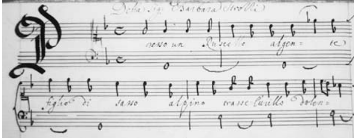
Example 5. "Presso un Ruscello argente." Venice, Collection of Biblioteca di Conservatorio Benedetto Marcello.

(1605-1674), on pages 97-116, uses the chaconne from "The Secret Lover." Carissimi also uses a double entendre on Barbara's name, a device that she used often in her own compositions: "Barbara still seems to be the name cruel and 'barbaric' in his bosom." 19 Could this also be related to the Secret Lover? Pier Francesco Cavalli (1602-1676), Barbara's teacher from youth and evidently a life-long friend, presents in this same manuscript a cantata with a conceit on Barbara's name: "Ah can I tell myself in what beauty Barbara's (barbarian) fate lies." 20