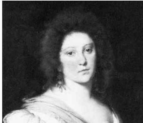
Barbara Strozzi: Suonatrice di violoncello , Bernardo Strozzi (1639), Gemäldegalerie, Dresden

More than any other available work, the Veglie provide insight into Barbara’s life as a teenage singer-composer. Printed between 1637 and 1638, before Barbara’s Opus One received publication, these little “Views” are “consecrated to the Gods as first fruits.” In the first Veglia , the acclaimed Paolo Vendramino, librettist for Manelli’s opera L’Adone , wrote that he was inspired to compose much fine literature because of her “song full of the marvels of eloquence.” He goes on to say that her “virtue would have moved the stones of Thebes,” and that she possessed a “fire comparable to the lyre of Apollo.” 8 It is interesting to note that in 1639, Vendramino’s libretto for L’Adone was published in the same volume