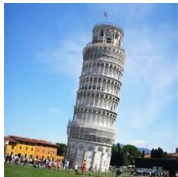
Leaning Tower of Pisa

Result of a colossal miscalculation which made it lean