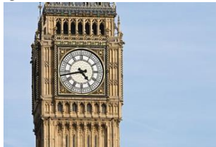
Big Ben Clock Tower