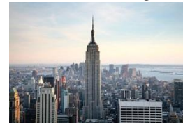
Empire State Building