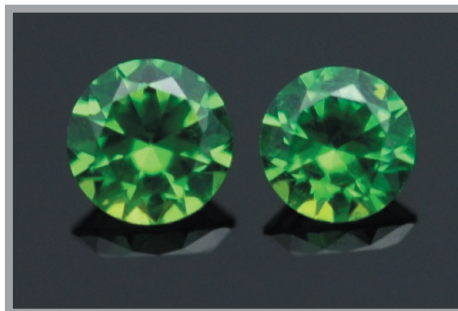
These cut and polished gem stones are a rare, green variety of andradite garnet, also known as “demantoid” garnet. Cut garnets are prized for their beauty and are also commercially valuable for use in jewelry.

Garnet can also be used in mining exploration as an indicator to help locate diamond deposits. Diamonds only form at great pressure and temperature and are associated with kimberlite, an intrusive igneous rock that comes from deep within the Earth. As the molten rock (magma) that cools to form a kimberlite rises toward the Earth’s surface, it incorporates fragments of rocks and minerals, including garnets with distinct color and composition that form under the same conditions as diamonds. If these distinct types of garnet are found in sediments, they may indicate the presence of nearby diamond-bearing kimberlites.