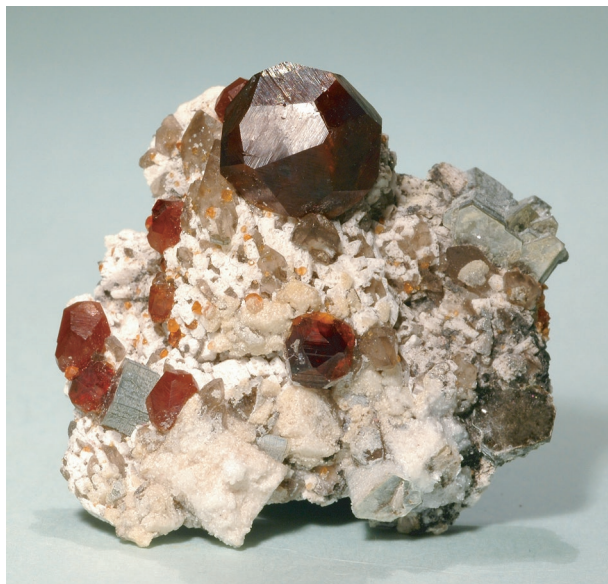
Photograph of a mineral specimen containing large crystals of the garnet mineral spessartine (red), showing the distinctive “euhedral isometric” crystal form of garnet. Used since ancient times for jewelry, the first industrial use of garnet was probably in coated sandpaper manufactured in the United States by Henry Hudson Barton in 1878. The United States currently consumes about 16 percent of the global production of industrial garnet.

G arnet is one of the most common minerals in the world. Occurring in almost any color, it is most widely known for its beauty as a gem stone. Because of its hardness and other properties, garnet is also an essential industrial mineral used in abrasive products, non-slip surfaces, and filtration. To help manage our Nation’s resources of such essential minerals, the U.S. Geological Survey (USGS) provides crucial data and scientific information to industry, policy-makers, and the public.