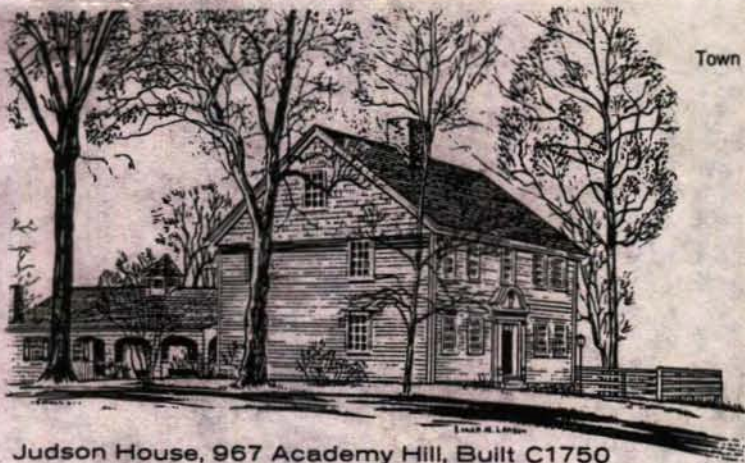
Judson House, 967 Academy Hill, Built C1750 and Catharine B. Mitchell Museum, 1958