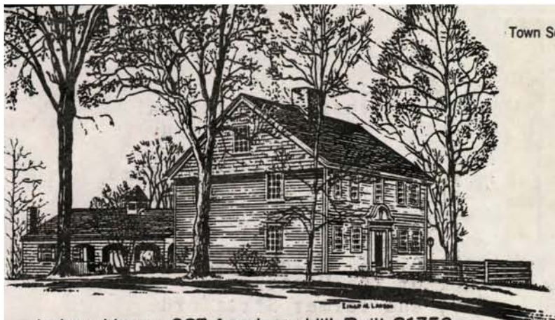
Judson House, 967 Academy Hill, Built C1750 and Catharine B. Mitchell Museum, 1958

Box 382, Stratford, Connecticut 06497 Telephone 378-0630