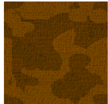
ppat for my Afrika-Mod