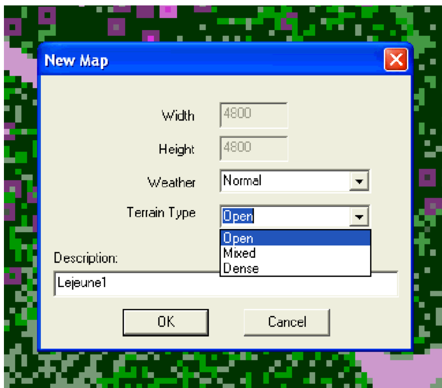
Picture 2: The originally intended meaning of the 6th line: terrain type (as for CCM v3.1).

The original CC4-maps have here always the general map weather descriptor set to 3 = light snow and the value zero for the map name color descriptor. Only two original CC4 maps have a map's name entry (full length: Hotton and Marche).