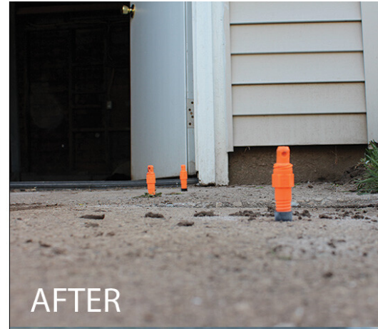
Prepping holes for mud jacking