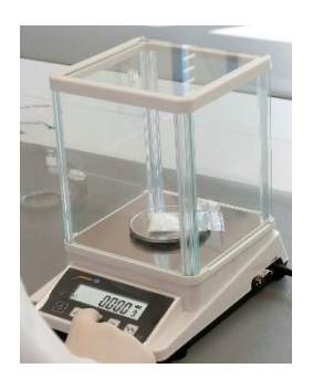
only PCE-BSK 310 includes wind shield