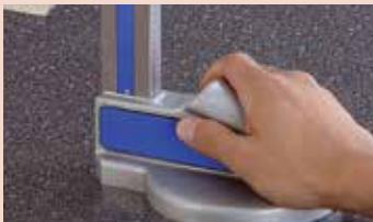
Comfortable grip base