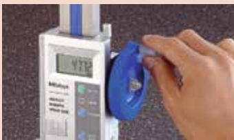
Large smooth slider feed wheel