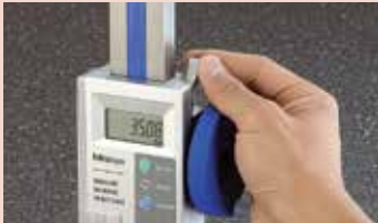
Large clamp lever