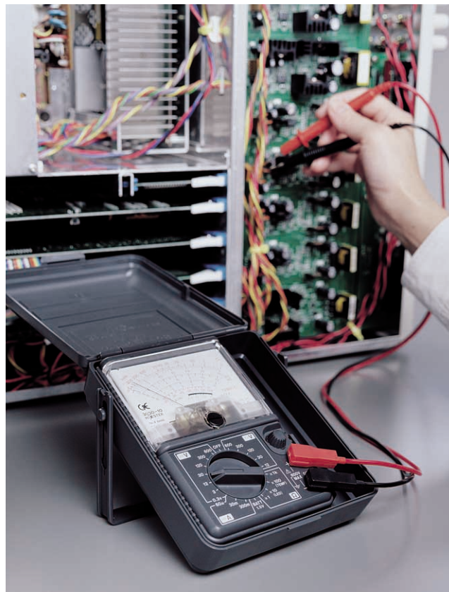
Carrying handle of the supplied case becomes a stand.