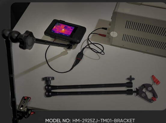
MODEL NO: HM-2925ZJ-TM01-BRACKET

Use with desk mounting bracket for more flexibility and comfort during thermal inspection