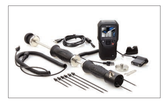
FLIR MR160-KIT5 PROFESSIONAL IMAGING MOISTURE KIT

Kit includes the FLIR MR160 Imaging Moisture Meter and the FLIR MR08 Hammer / Wall Cavity Probe.