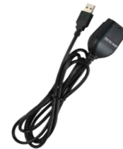
Data Transmission Cable