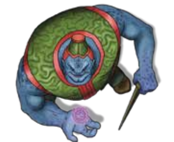
5th Step: Final token with no background.