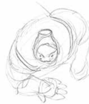
1st Step: Rough Sketches

Please send requests to: Devinnight@immortalnights.com