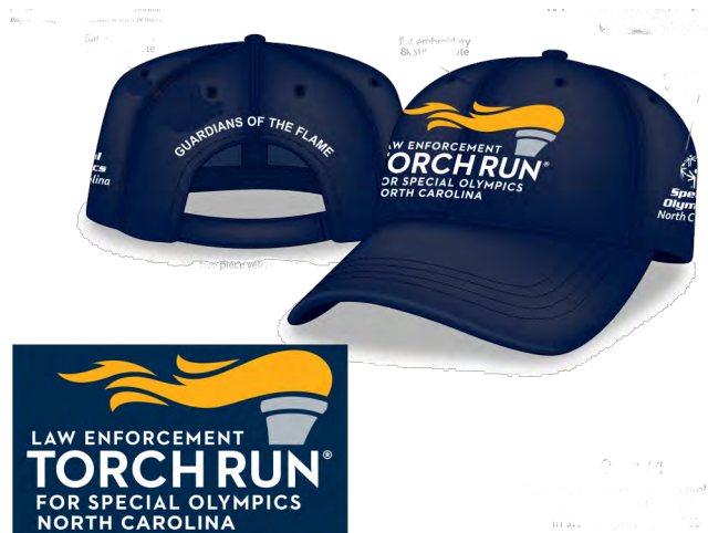
Unstructured Hat - $15 Tech