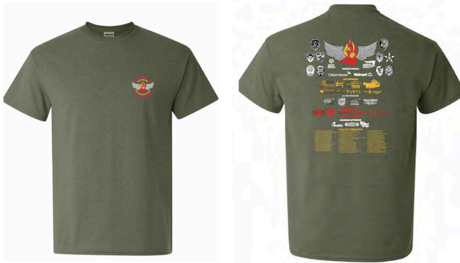
Cotton Shirt - $15