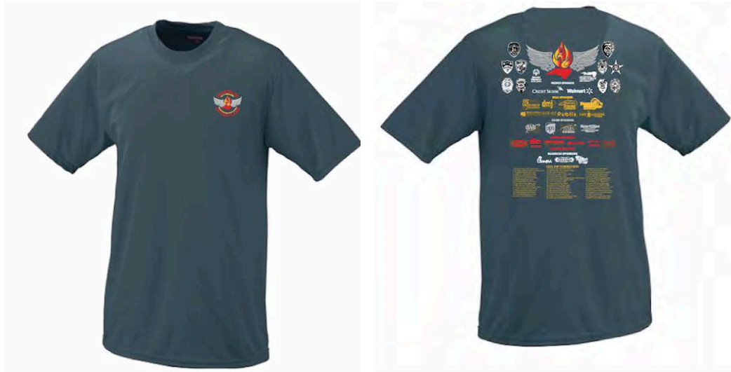
Technical Shirt - $20