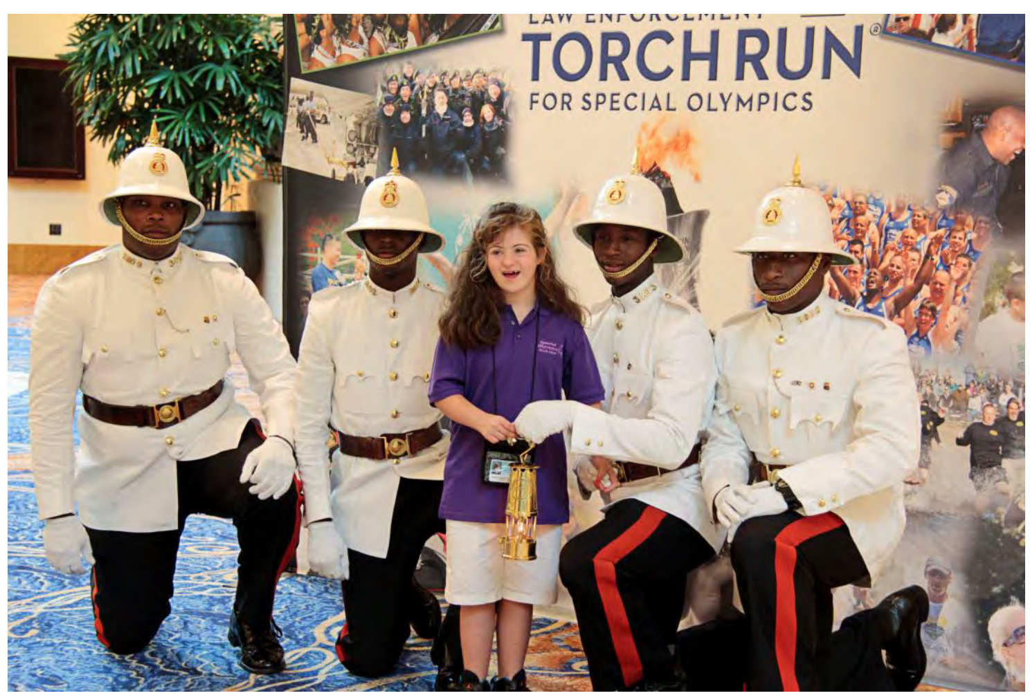
Law Enforcement Torch Run Conference Atlantis, Nassau Bahamas

The Newsletter of the Law Enforcement Torch Run® Executive Council