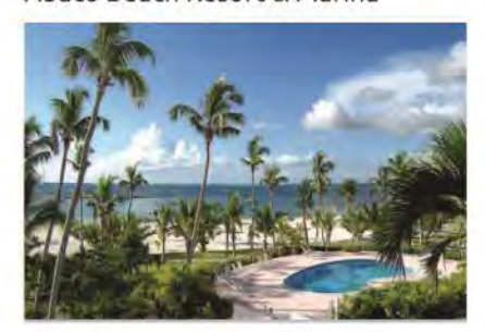
FROM $220 per night*