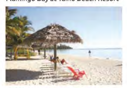
FROM $83 per night