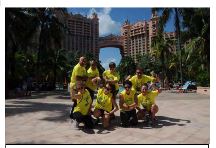
Bacon Bits

During the conference Hurricane Joaquin made land fall in the southern most islands of the Bahamas. Our prayers and thoughts go out to the families of those who resided in harm's way. We all know that the Royal Bahamas Police Force were not only taking care of the community during this natural disaster, they were also making sure that the conference attendees were well