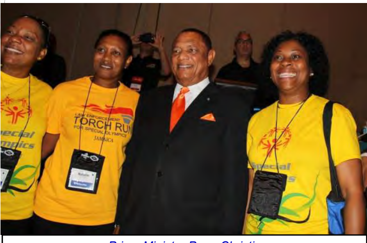
Prime Minister Perry Christie

We were all honored by the presence and the heartfelt speech of Bahamas' Prime Minister Perry Christie. Thank you so much for taking time out of your busy schedule to make an appearance at our conference.