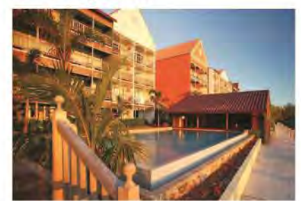
FROM $124 per night