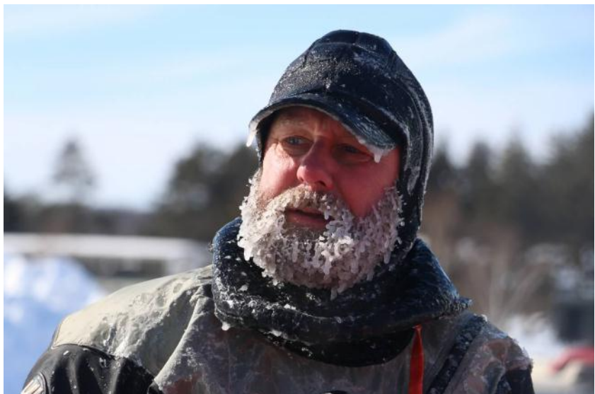
Law enforcement volunteers for the 2014 Minnesota Polar Bear Plunges endured record cold temperatures.

One change to the Plunges this year was a push to further the involvement of Special Olympics teams. Through this initiative, Special Olympics Minnesota teams raised 77% more funds than in 2013. We are excited to see what the future holds for the Minnesota Polar Bear Plunges!