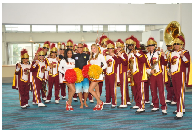
The USC Marching Band led the way for the Torch entrance.