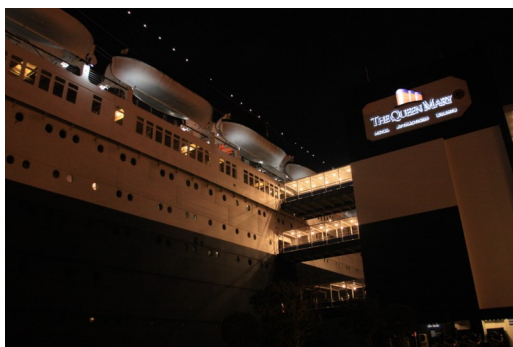
Host Night was on the elegant Queen Mary Ship.