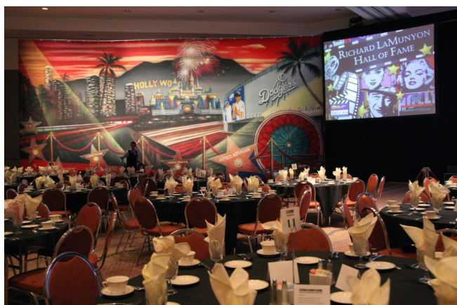
An Academy Awards to remember....as we honored our Torch Run heroes.