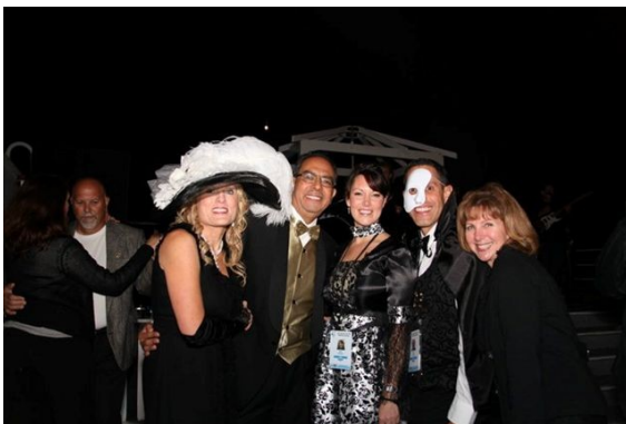
The Black and White theme aboard the Queen Mary was a hit for Torch Runners.