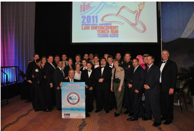
What an awesome experience to host the conference!