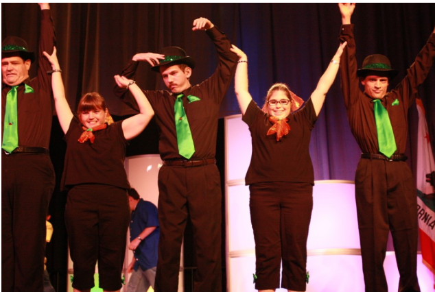
We were entertained by the High Tops Dance Ensemble!