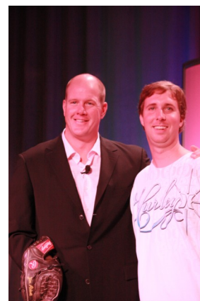
Jim Abbott's message of perseverance resonated with the audience.