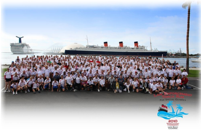
LETR IC Torch Runners