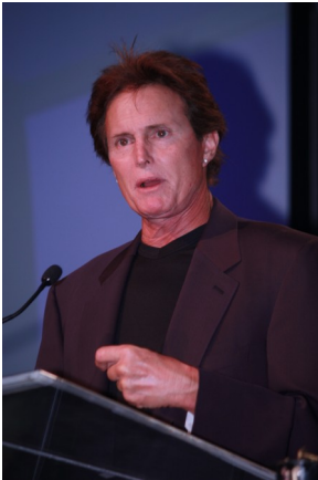
Bruce Jenner inspired us to set our goals high!