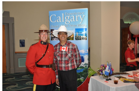
Calgary, here we come!