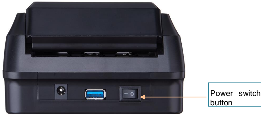
Figure 3-2 IMC02 Power Interface

Turn on the IMC02 by switch the power switch button to on, the screen will light up and the machine will start self-testing. If the self-test is successful, the number of banknote and the denomination will show as '0'.