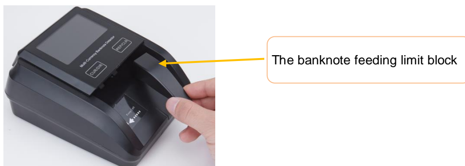
Figure 3-4 Banknote Insertion

As shown in the following figures, please remove the banknote feeding limit block to adjust the banknote with bigger size.