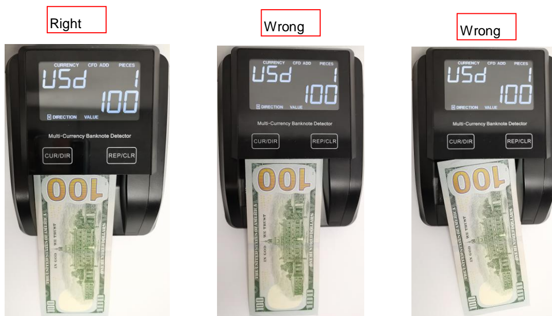
Figure 3-3 Banknote Insertion

As shown in the following pictures, please insert the banknotes in the left side. If a banknote was incorrectly inserted, the IMC02 may refuse it and alert.