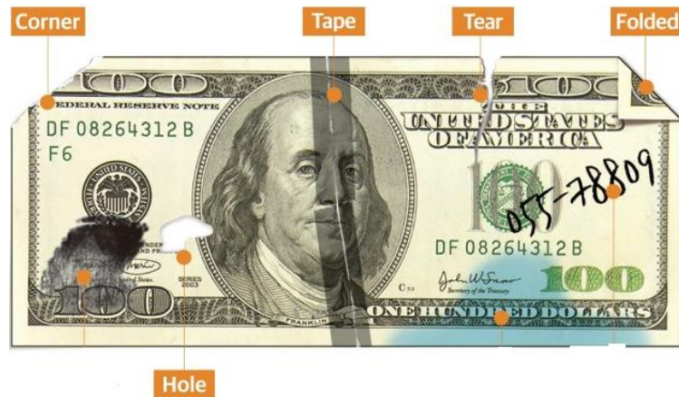
Figure 4-1 Bill Damaged Ways