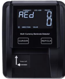
Figure 1-1 IMC02 Counterfeit Detector

We reserve the right to change the contents of this user manual at any time without notice.