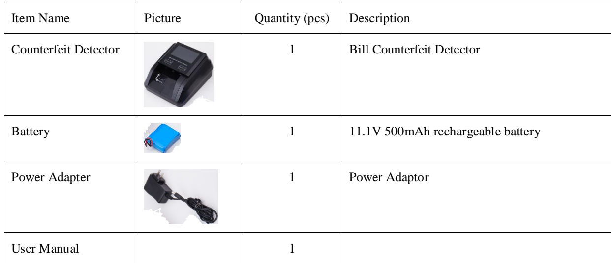
Table 2-1 Packing List

When you receive the package, open and check the packing list in the package.