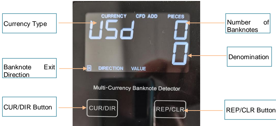
Figure 3-1 IMC02 Display Appearance