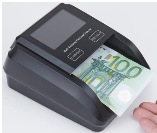
Figure 3-5 EUR Banknote Detecting