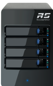
RocketStor 6414S - 4-Bay Diskless SAS/SATA Tower Enclosure