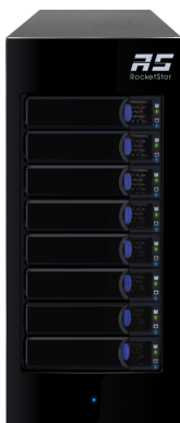
RocketStor 6418S - 8-Bay Diskless SAS/SATA Tower Enclosure