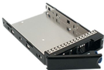
RocketStor Tray-T- 3.5" Hot-Swappable Hard Drive Tray

HighPoint Headquarters Phone 1-408-942-5800 Fax 1-408-942-5801 E-mail sales@highpoint-tech.com Website www.highpoint-tech.com Address 1161 Cadillac Ct. Milpitas CA, 95035