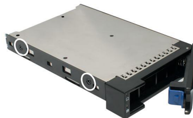
Figure 2. HDD mount points (side)