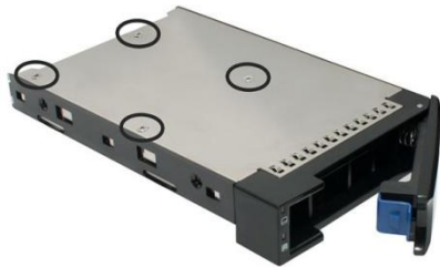
Figure 1. SSD mount points (bottom)