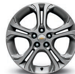
17" Painted-Aluminum (Standard on LT)