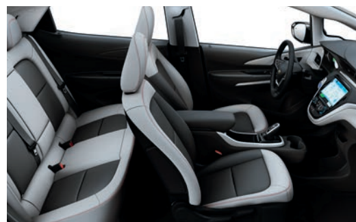
Dark Galvanized Gray Leather Appointments with Sky Cool Gray Accents 5