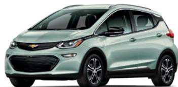
GREEN MIST METALLIC 2 (With Black Grille)