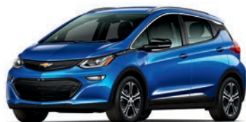
KINETIC BLUE METALLIC 3 (With Black Grille)