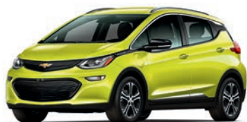
SHOCK 3 (With Black Grille)