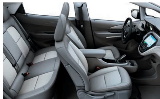
Ceramic White Leather Appointments with Light Ash Accents 5