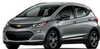
SLATE GRAY METALLIC (With Black Grille)