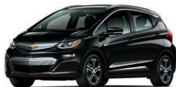
MOSAIC BLACK METALLIC (With Dark Silver Grille)