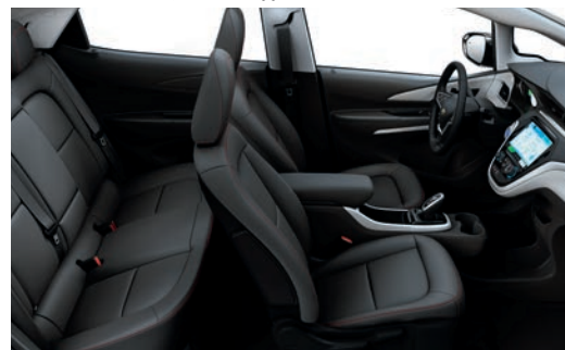
Dark Galvanized Gray Perforated Leather Appointments 5