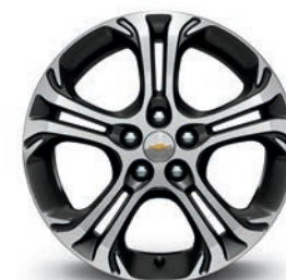
17" Ultra Bright Machined-Aluminum with Painted Pockets (Standard on Premier)