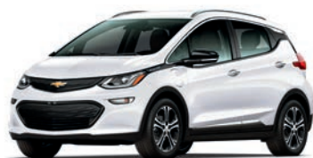
SUMMIT WHITE (With Black Grille)