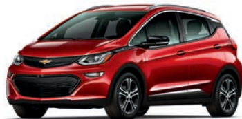
CAJUN RED TINTCOAT 3 (With Black Grille)