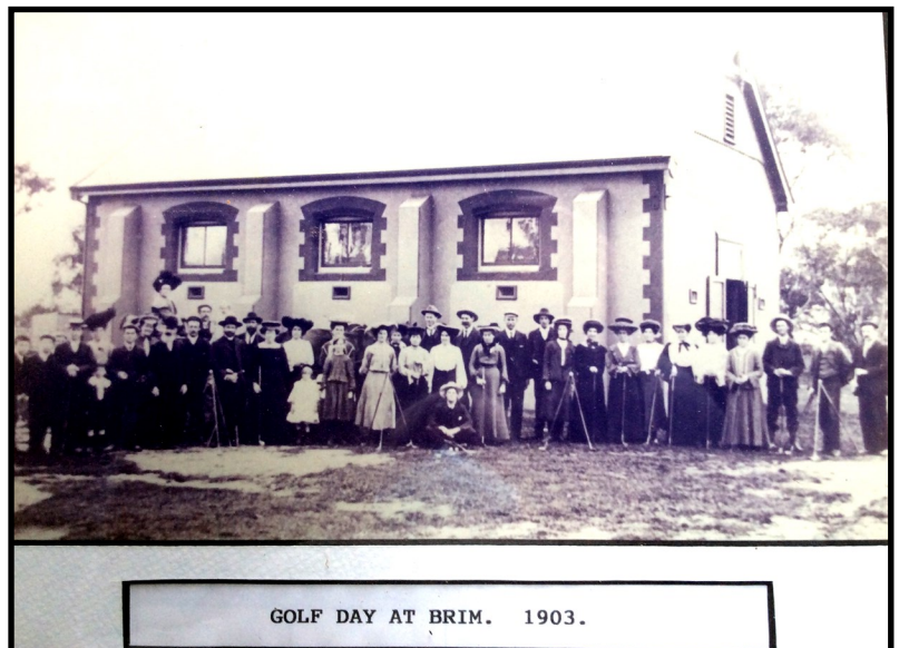
GOLF DAY AT BRIM. 1903.

The story of the battles and heart-breaks of those early pioneers, could it be related, is one that would make us, in the comfort of modern times, stop, and ponder on the debt of gratitude which owe to them.