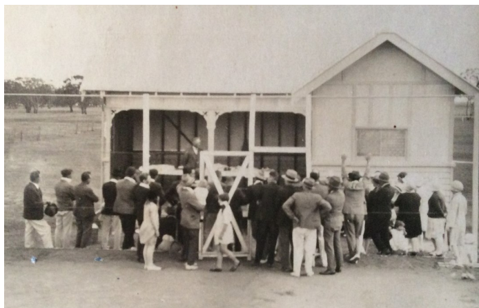
Left: Opening of the Brim Tennis Pavilion in 1929.