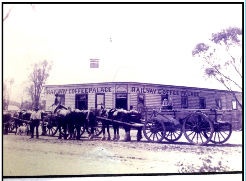
Above: Pictures from the early days in Brim