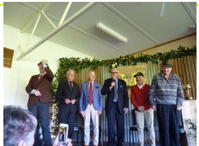
TOP: Men contestants