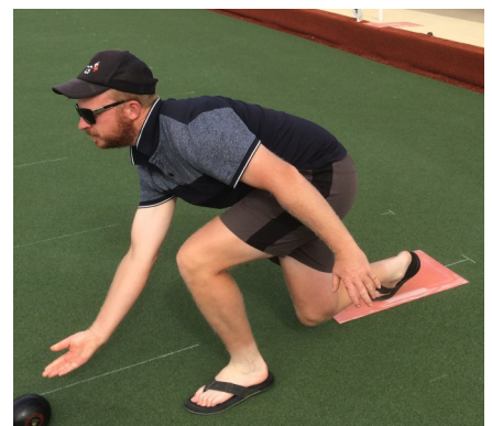
Below: Some trying out bowls