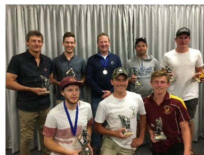
BKSHCC 2019/20 Trophy Winners