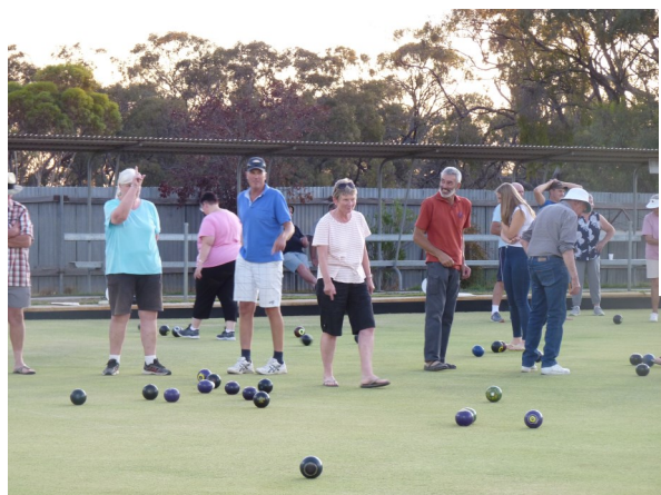
A busy time on the green