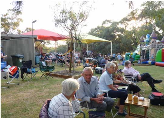
Relaxing on New Year's Eve