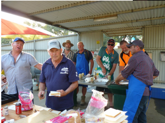
Cooking the barbecue