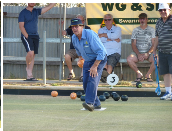
Wavell in good form.