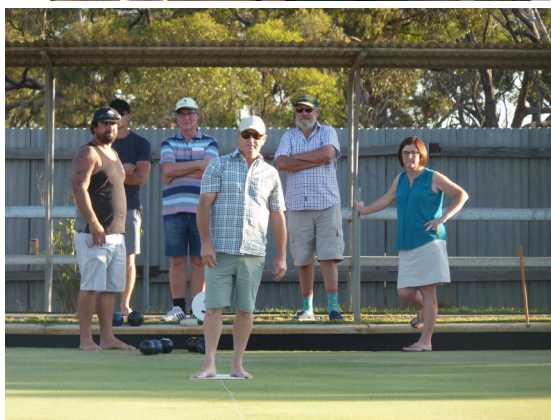
This game is serious!