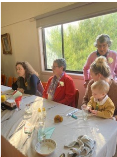
Attendees enjoying their meal and social interaction.