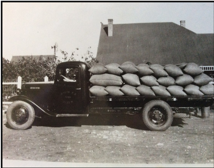
Above: A bit later in 1900s