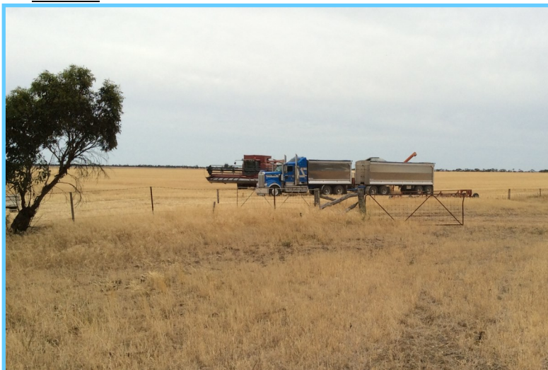
Above: December 2013