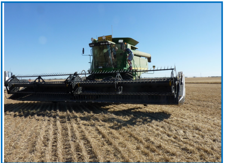
Above: 2020 harvesting