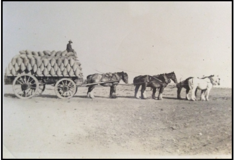
Above: Early days of harvesting