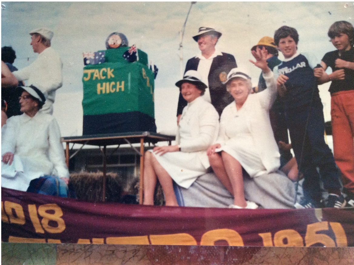
Some former Brim Bowlers on a Brim float in a parade in Warracknabeal:

Remaining dates for this competition are August 5th and 19th.