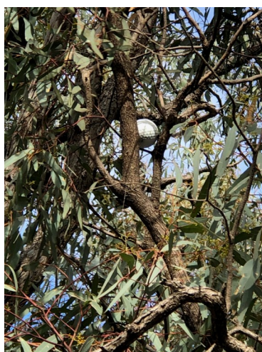
The ball lodged in the tree.