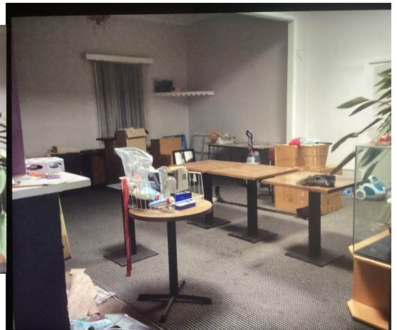
Still needing touch-ups are the east side of the bar (left) and the dining room (right). The middle photograph shows the framework dividing the dining room from the renovated toilets.