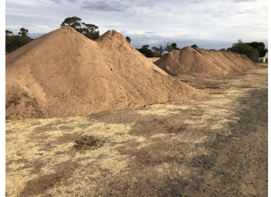
Above: March 12, sand carted. Below left: April 5th, Middle: April 7th, Right: April 8th.