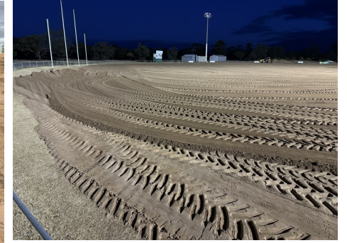
Above: April 9th with night work being done on far right. Below from left: April 14th 21st and 28th.