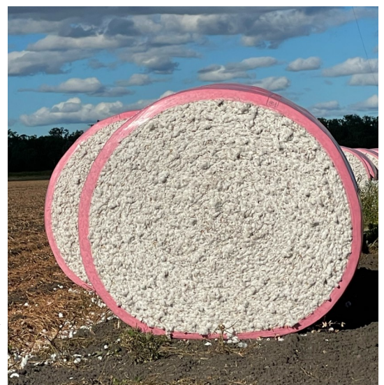
Cotton Bales near Banana, Qld.