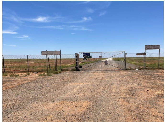
Warri Warri Gate & Dog Fence at the Queensland/ NSW border

As he was unable to go to Cameron Corner due to road damage from the January floods, he headed straight north to Warri Warri Gate Dog fence and into Queensland..