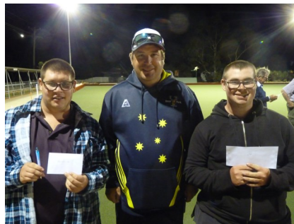
Runners-up : The woodbine team