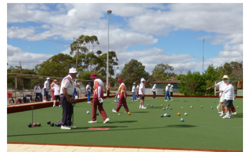
Activity on the green