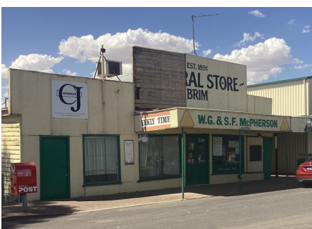
Left: The original General Store after it was closed.