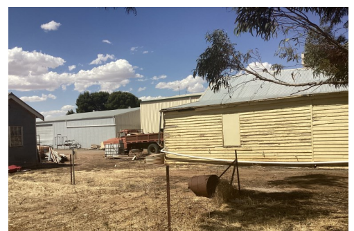
Right: west side of the original General Store with newer sheds in the background.