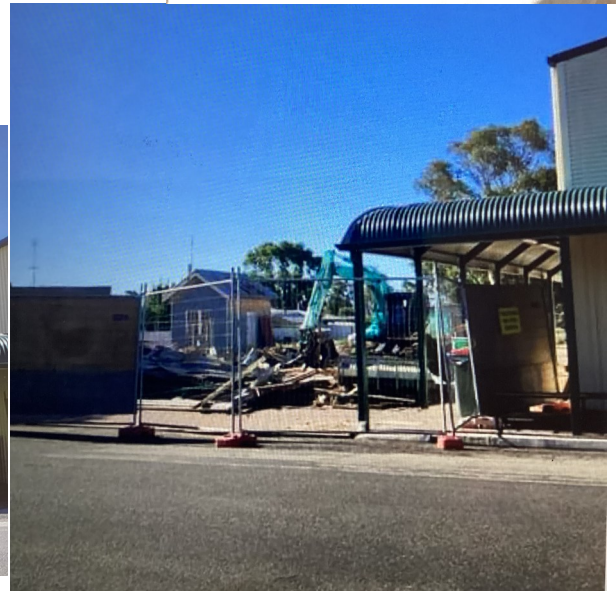
The Original Brim General store—Going .....Going and (below) gone! (a carpark will be built on the site of the store).