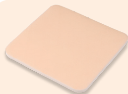
Advazorb® Hydrophilic foam dressing with film backing

Advazorb®, Advazorb Silfix® and Advazorb Border® are available in both a regular thickness for moderate to high exudate and 'Lite' versions for low to moderately exuding wounds.