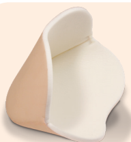
Advazorb Heel® Hydrophilic foam dressing with film backing

A conformable, non-adherent, hydrophilic, polyurethane foam dressing with a breathable film backing designed to fit around the heel.