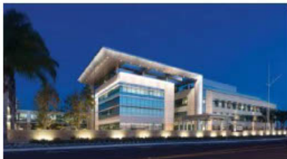
CAMP PENDLETON NAVAL HOSPITAL