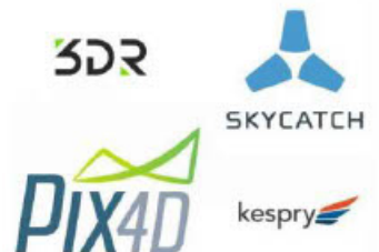
DRONES & NEW COMPANIES (20++ IN VARIOUS INDUSTRIES)