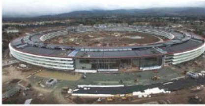
APPLE CAMPUS 2