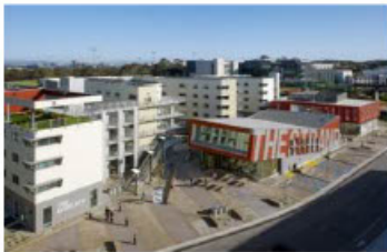
UCSD VILLAGE EAST