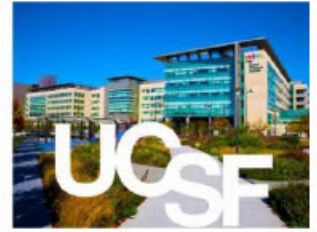
UCSF BENIOFF HOSPITAL