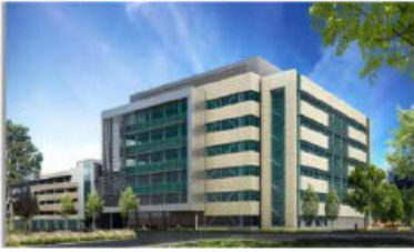
GILEAD 357 – LAB