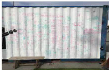
VR CONTAINER, MAKERFAIRE