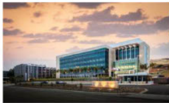
FBI SAN DIEGO HEADQUARTERS