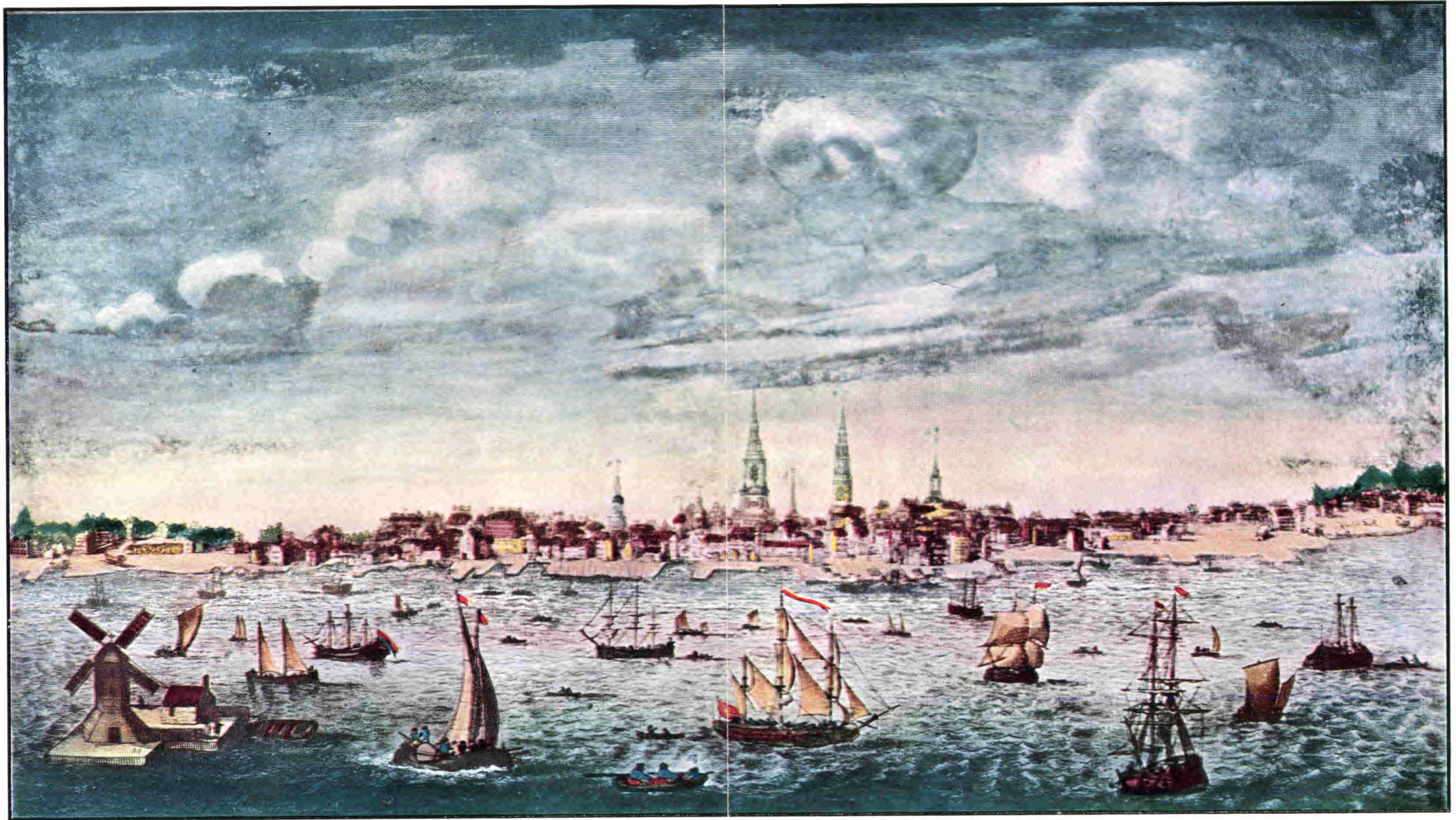
Harbor of Philadelphia, seen from New Jersey Shore, based on Scull's Map of 1754 (From Etching in The Historical Society of Pennsylvania)