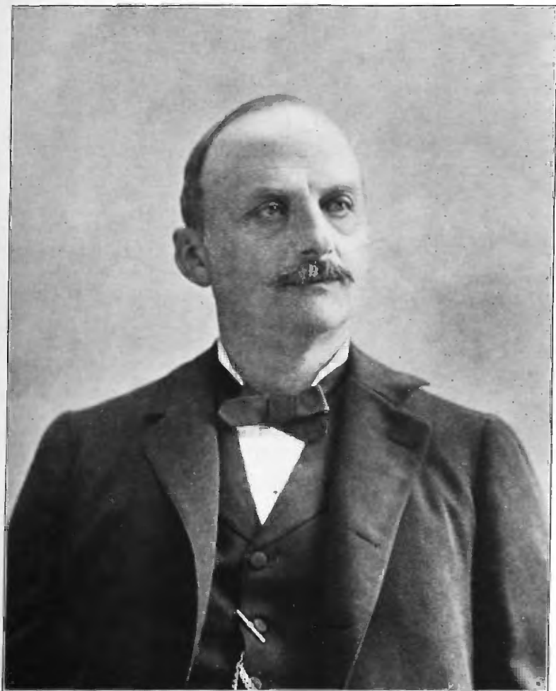
GOV. GEORGE D. ROBINSON